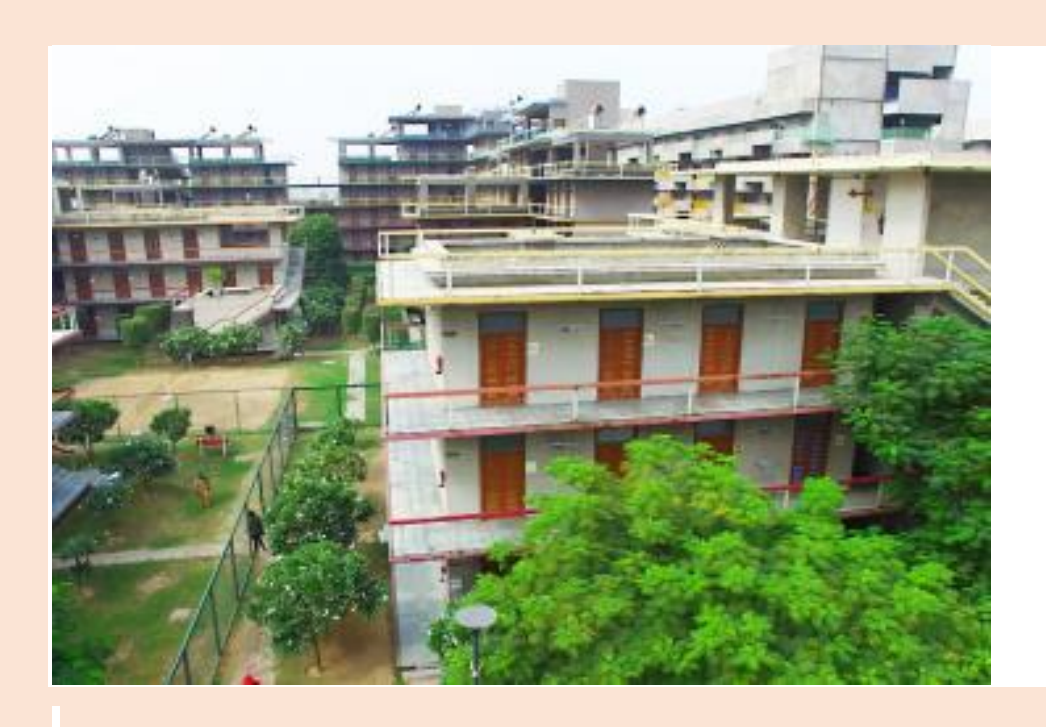
Health Care - http://jgu.edu.in/health-care