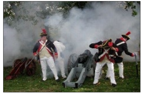
The Feast of the Hunters' Moon is a recreation of the annual fall gathering of the French and Native Americans which took place at Fort Ouiatenon, a fur-trading outpost in the mid - 1700s.

There are also special events and festivals that take place at Purdue and in the Greater Lafayette area every semester. The fall semester also includes fun and interesting events such as Global Fest (near campus at the Morton Community Center) during early September's Labor Day weekend, and the Purdue Homecoming Celebration and the Feast of the Hunter's Moon at Fort Ouiatenon in October. During the spring, Purdue's Spring Fest and the International Food Bazaar, both in April, are highly anticipated events