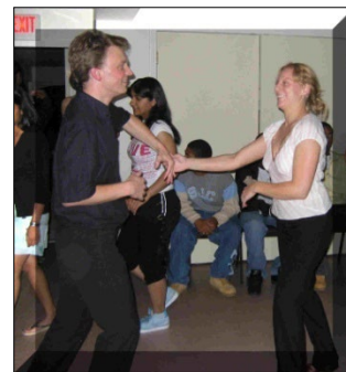
The International Center (IC) hosts a variety of cultural events and activities

The International Center (IC) in the Purdue campus also organizes several social events throughout the semester. Visit the IC website at: www.intlctr.org . More information on the arts and music scene in the Lafayette area can be found at: www.homeofpurdue.com/events .