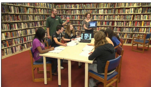
Hitting the books at the Hicks Undergraduate Library

In the United States, class attendance and participation are normally considered course requirements. You can expect daily or weekly homework assignments, frequent short tests or “quizzes” (announced and unannounced), and teachers keeping track of the number of times you participate in class discussions. At the end of each semester, final examinations are given and may cover the entire course content or only a portion of it. In addition to the final exam, most classes will have a mid-term exam. While many different types of testing are used, multiple choice, true/false, and short answer exams are the most common in lower-level courses. Upper-level courses usually involve essay exams and research papers. Engineering, Science, and Polytechnic students can expect problem-solving assignments, while Management students frequently work on group projects.