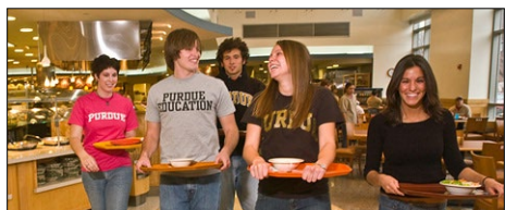
Meet new friends at the dining hall!

Meals provided in the University Residences' dining facilities offer a wide variety of tasty options. Students living in the Purdue dormitories may choose a 20-, 13-, or 8-meal plan as part of their housing contract. If no meal plan is available or required, all students have the option to open a BoilerExpress account ( www.purdue.edu/business/card ).