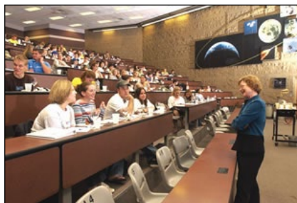
A lively lecture in the Class of 1950 Lecture Hall

University professors in the United States generally welcome classroom questions and discussions with their students. In addition, professors maintain regular “office hours” - times during the week when they are available to meet with their students to discuss course topics, homework assignments, or any related subject matter of interest to the student. You should take advantage of office hours if you want to have additional discussions with your professors about a previous lecture, a homework assignment, or if you have grade concerns. Office hours are usually listed in the course syllabus that the professor will distribute on the first class meeting.