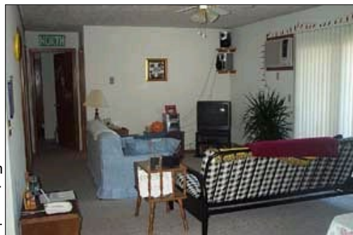
A typical student apartment... Exchange students can live alone in a one-bedroom apartment, rent a 2- or 3-bedroom apartment with other students, or sublease an apartment.

www.purdueexponent.org/classifieds www.boilerapartments.com/subleasesearch.aspx