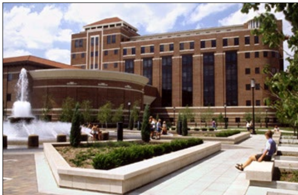
Founders Park with the Beering Hall of Liberal Arts in the background is a popular hangout area for students.

The Study Abroad Office holds a casual Welcome Reception each semester during the first week of class. We invite new incoming exchange students as well as Purdue students who have just returned from their own studies abroad. It is a wonderful way for students to mingle, share stories, and match faces with names! We will also invite you to join PASSPORT, a social group of exchange students and Purdue students who have studied abroad. Many fun activities are planned through PASSPORT, so take advantage of the opportunity!