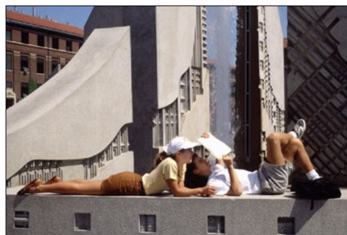
Students relax while studying at the Purdue Mall