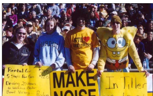
Purdue students cheer on the Purdue Boilermaker football team!

If students would rather compete than exercise, the Purdue Recreational Sports Center sponsors several club sports teams and organizes athletic tournaments every semester. The website for the various club sports at Purdue is: www.purdue.edu/recwell/programs/clubSports .