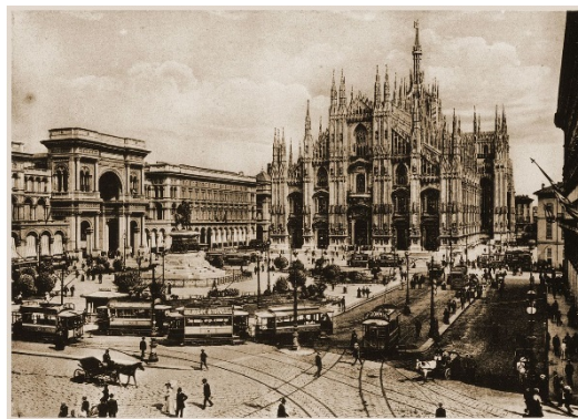
Milano Piazza Duomo - 1900