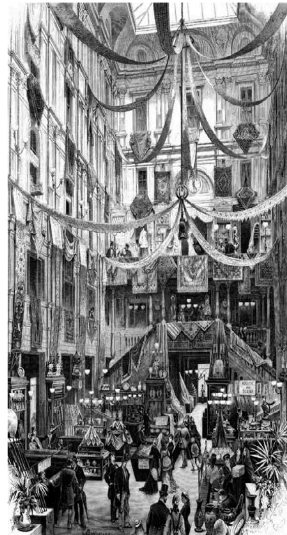
Magazzini "La Rinascente"