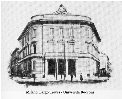
Bocconi in 1902